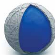
Contains the two most active isomers of the eight in cypermethrin.