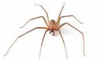
Cellar (top), black widow (middle), and brown recluse (bottom)