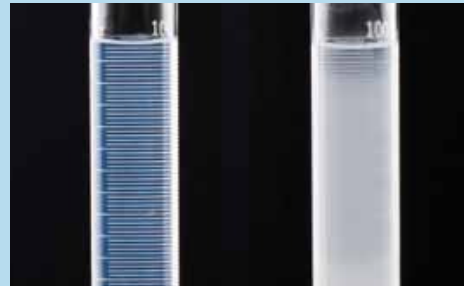
This image demonstrates the clear difference in consistency between Transport Mikron (left) and Demand® (right).