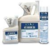
Cy-Kick CS smartcaps cling to brown recluse spiders as they crawl across treated surfaces.

Cy-Kick® CS SmartCaps easily cling to brown recluse spiders as they crawl across treated surfaces. This makes it a great spot treatment product choice.