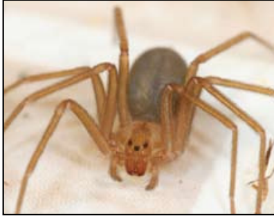
Stoy Hedges, 2006

Approximately 3/8" long by 3/16" wide, light tan to dark brown with distinctive violin shaped marking on the cephalothorax (neck of violin pointing toward abdomen). Six eyes arranged in semicircle of 3 pairs.