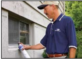
Cy-Kick CS can be applied around door frames, gaps between siding, foundation and basement window frames to control brown recluse spiders.