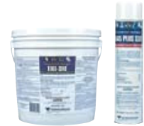
Tri-Die Silica + Pyrethrum Dust and PT 565 Plus XLO is recommended in addition to Cy-Kick CS.