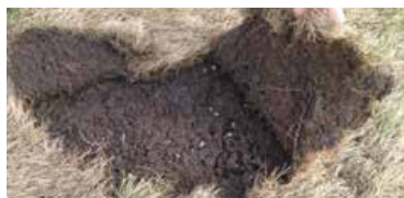
Grub Damage on Turf