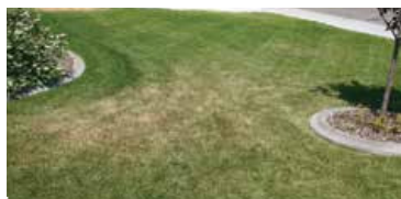
Lawn Damaged by Billbug Larvae